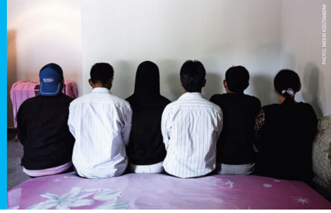
"We came to tell about our working conditions in secret. If our boss would find out that we talk to journalist, we would be in serious trouble."

trial unrest by workers unhappy at their conditions at Vita Food.