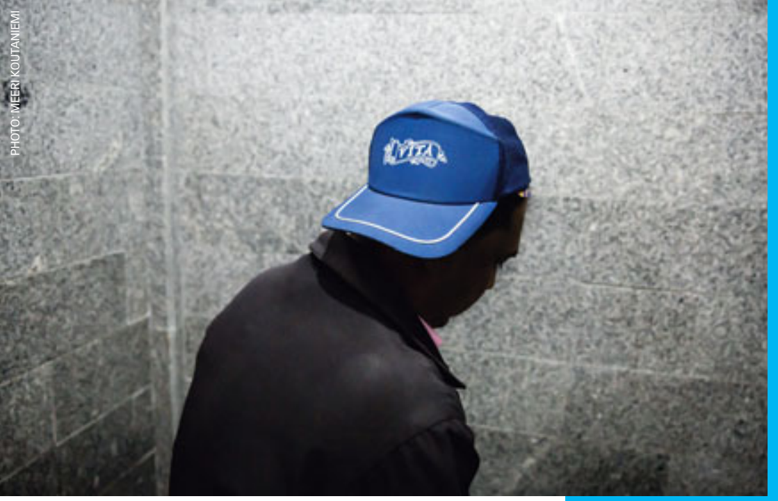
"My daily salary is 300 baht and I have to pay for all working equipments. This cap costs 150 baht."