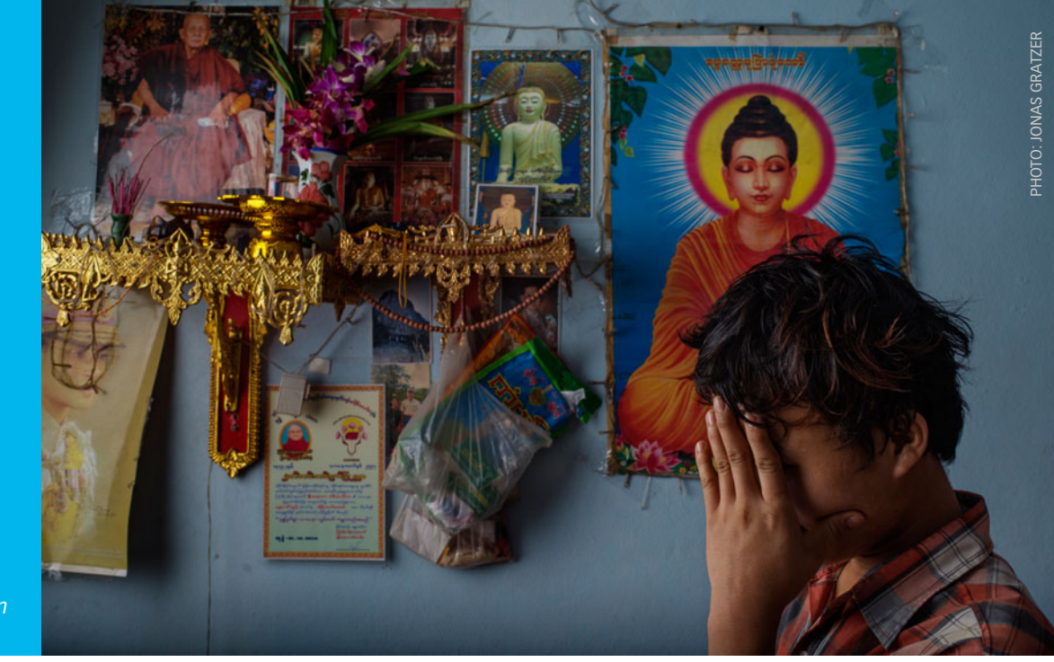
According to Thai law, migrant workers cannot establish their own trade unions.

permits freedom of association to workers working in the private sector.<sup>11</sup> According to this law, migrant workers cannot establish their own trade unions but can join as members of existing unions created by Thai nationals. However, migrant representation is often a mere formality. There are few trade unions as Thailand has the lowest rate of unionisation in South East Asia. Only 1.5% of the workforce has union membership.<sup>12</sup> The level of interest that trade unions have in representing workers also varies. Unions have been accused of passiveness and outright corruption, as well as promoting the interests of employers and those in power.<sup>13</sup> Workers, who make an effort to organise, are harassed and fired illegally.