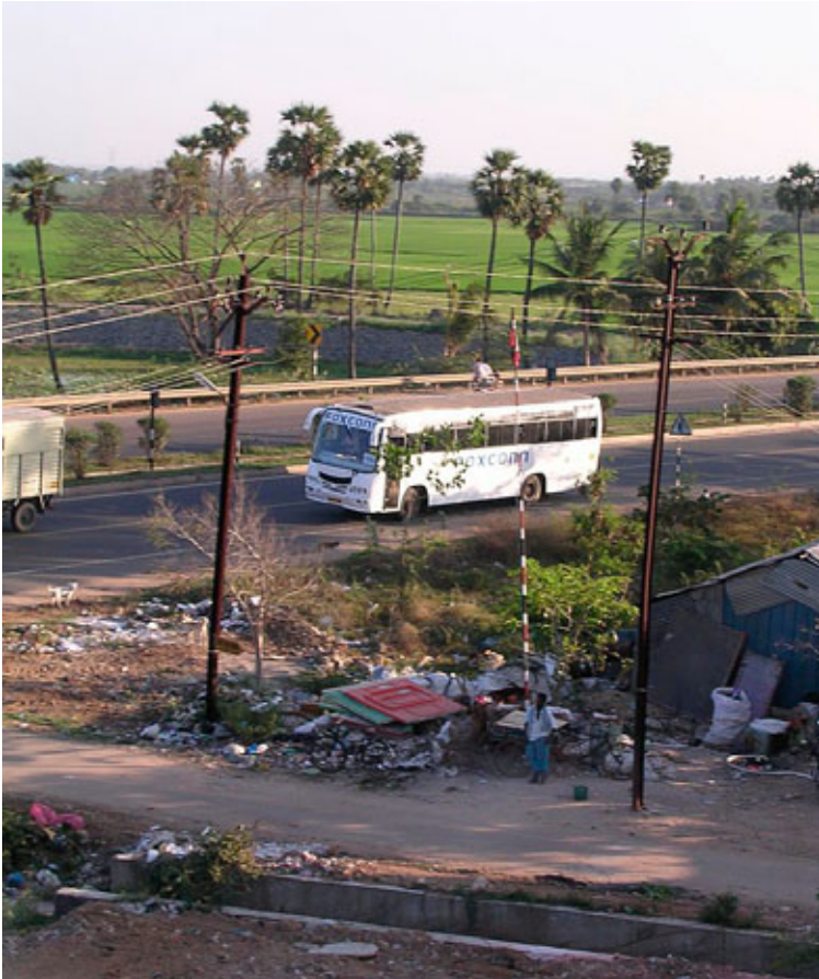
Foxconn's shuttle bus on the Chennai-Bangalore national high way taking workers to the factory.