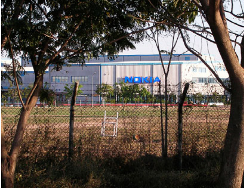
Nokia's factory behind a fence in Sriperumbudur.

are different from shipping and warehousing (both of which seem to be manned by contract staff). There are 23 lines operating simultaneously in the ENO where each line is capable of producing a new phone every two to four seconds throughout the day. This could mean a production of 162,000,000 phones per year in the factory assuming a phone every four seconds with 25 days per month operations. The factory operates on a four-shift basis where one shift is always off. There are 2,500 people working in each shift. One shift lasts eight hours including a half hours' lunch break.