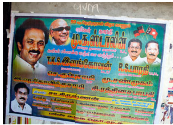
A poster of the LPF union with DMK party leaders.