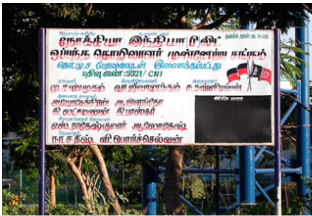
A banner of the LPF union in the front of the Nokia Telecom SEZ.

The recent worker unrest in Chennai mobile phone industry (strikes at Nokia in 2009–2010 and at Foxconn in 2010) and the subsequent introduction of unions represents an entirely new chapter in labour relations in India's Special Economic Zones. Most of the labour protests in the mobile phone industry have been related to the abuse of short-term contracts and salaries deemed too low. For example, issues that caused the first strike at Nokia in August 2009 were low wages and refusal of the company to pay annual increments. The second strike in January 2010 was caused by shift of workers on the shopfloor and later the dismissal of 63 workers due to strike activities. The third strike in July 2010 was organised demanding the reinstatement of the suspended workers and a revision in the wage settlement agreed upon after the first strike. The first agreement between the company and the LPF union was formalised in October 2009. The suspended workers were later taken back by Nokia as part of the June 2010 wage settlement signed with LPF. 58