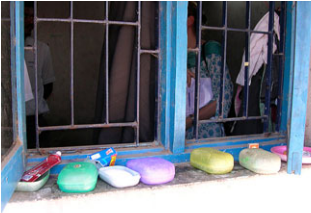
Foxconn workers in their two room's apartment (monthly rent of Rs. 2,500 / 40 euros) shared by seven men. Each of them kept a soap on the window ledge.