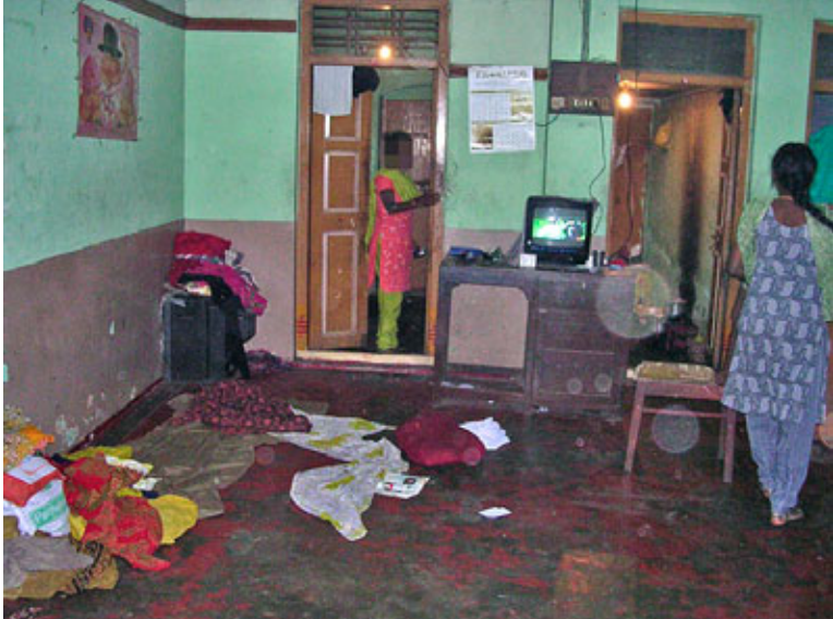
A room and kitchen shared by twenty-five women working for Nokia and Foxconn.