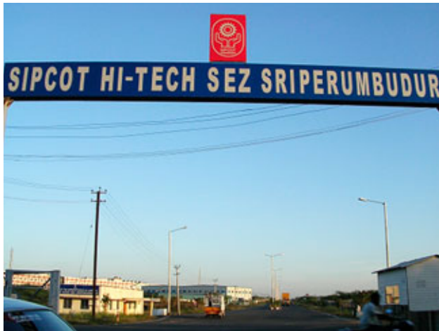
Gate of the Sipcot Hi-Tech Special Economic Zone, where a unit of Foxconn is located.