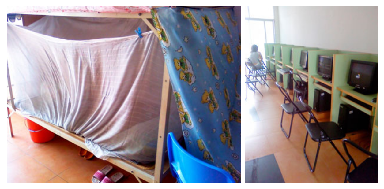
Celestica's dormitory and computer rooms.

issues) and provides a housing subsidy of 80 yuan for each worker residing outside the factory. According to the interviewed workers, the rooms are not crowded because many decide to live outside the factory and workers sharing the rooms work different shifts. However, there is still very little privacy in the factory dormitories. Many set up curtains around their beds. Bathroom facilities are adequate and hygiene level better than in 2008, according to the interviewees. Workers are not anymore responsible for cleaning their own dormitory rooms.