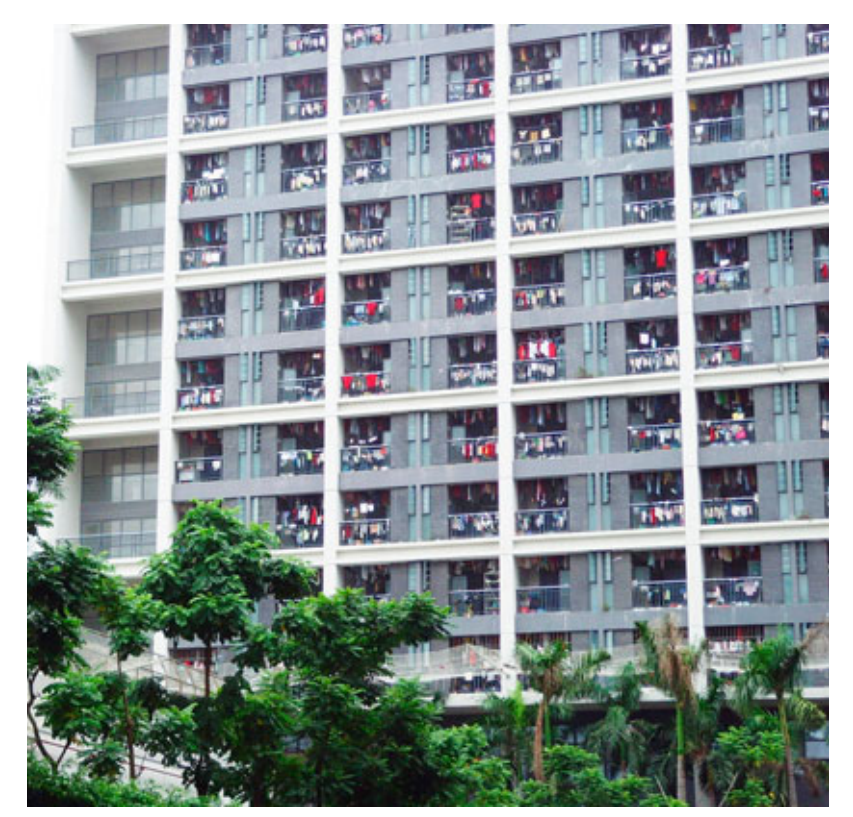
Facade of a dormitory and safety nets installed in the windows in the Foxconn Guanlan campus.